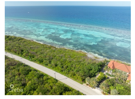
A serene oceanfront position. Create the ultimate coastal home.?? This tranguil elevated oceanfront lot provides the perfect setting for a waterfront home that epitomises luxury island living. Picture a residence where modern design meets tropical serenity, all tailored to your personal taste. In the

Cayman Islands, your home will be a sanctuary within a community known for its safety, stability, and high-quality amenities, offering an unparalleled lifestyle in a setting of