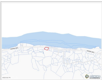
CK 69A, PARCELS 1, 2,& 84.